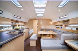
Cruiser 45 Interior

2001. 5Hp motor 850hrs approx. Feathering prop. Standard plus Doyles High Performance sails. 3 Double cabins. Broadwater stove. 2 Heads. Separate electric fridge and freezer. 3 Showers. Comprehensive Electronics. Dinghy/OB